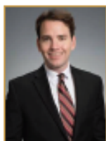
Kevin Kiley (R) District 6

District Office 9250 Laguna Springs Drive, #220 Elk Grove, CA 95758 916.670.7888