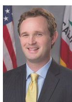
James Gallagher (R) District 3

Capitol Office, #3147 Sacramento, CA 95814 916.319.2003