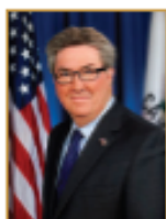
Ken Cooley (D) District 8

District Office 2441 Headington Road, Placerville, CA 95667 530.295.5505