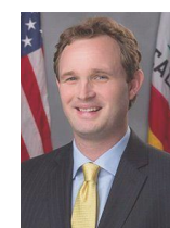
James Gallagher (R) District 3

Capitol Office, #3147 Sacramento, CA 95814 916.319.2003