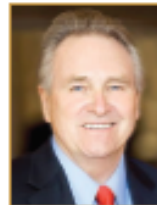
Jim Nielsen (R) District 4

District Office 8799-A Auburn Folsom Road, Granite Bay, CA 95746 916.774.4430